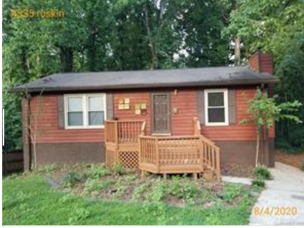
1 / 16

MLS#: 3648459 Category: Single Family Parcel ID: 149-163-23 Status: Active Tax Location: Mecklenburg County: Mecklenburg Subdivision: None Tax Value: $287,000 Zoning: R4 Zoning Desc: Deed Ref: 4376-288 Legal Desc: L11BC M6-851 RUSKIN DR Lot/Unit #: Approx Acres: 0.51 Approx Lot Dim: Lot Desc: Elevation: