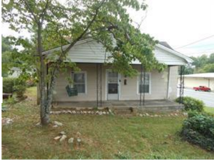
1 / 30